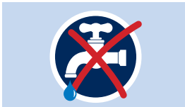
No water required